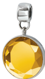
Yellow Bead November 255741