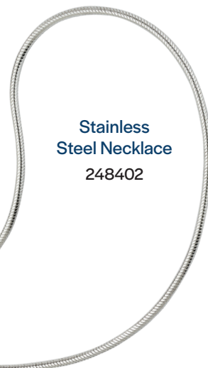
Stainless Steel Necklace 248402