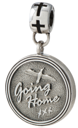
Going Home 248407