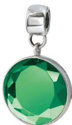
Green Bead May 255739