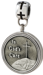
In God's Care 248413