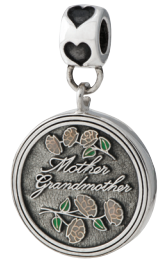
Mother & Grandmother 248405