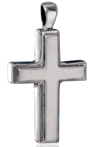
Sterling Silver Large Cross* 221618