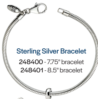
Sterling Silver Bracelet 248400 - 7.75" bracelet 248401 - 8.5" bracelet