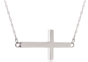
Sideways Stainless Cross