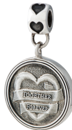
Together Forever 248426