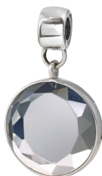
Clear Bead April 252343