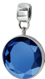
Blue Bead September 252342