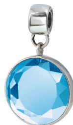
Medium Blue Bead December 255743