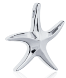
Sterling Silver Starfish* 255749