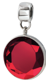
Red Bead July 252348