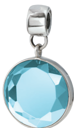
Light Blue Bead March 255738