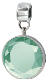
Light Green Bead August 255999