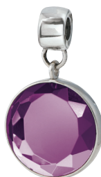
Medium Purple Bead June 255740