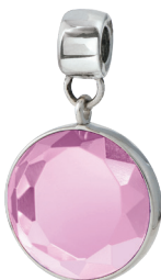
Pink Bead October 255742