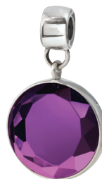
Purple Bead February 252341