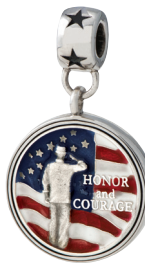
Honor & Courage 248431